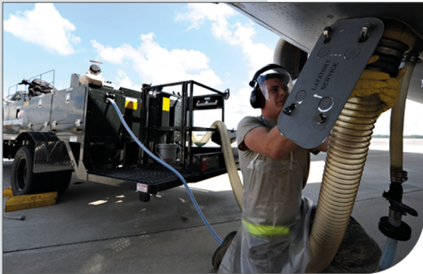
TSU - (Toilet Service Unit)