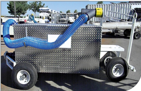
Equiped lavatory cart