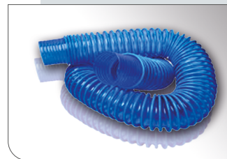
2 meter toilet discharge hose one-layer US-version