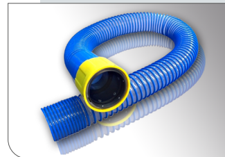
2 meter toilet discharge hose two-layer European-version